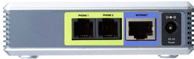
Figure 2-1: Back Panel

The Phone Adapter's ports are located on the back panel.