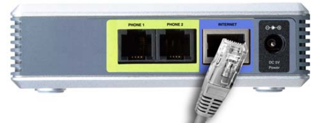
Figure 3-3: Connect the Ethernet Network Cable

The installation of the Phone Adapter is complete. Now you can pick up your phone and make calls.