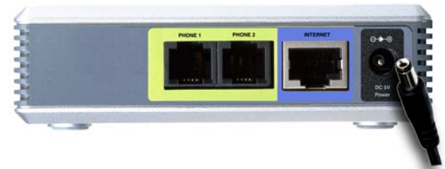
Figure 3-4: Connect the Power Adapter