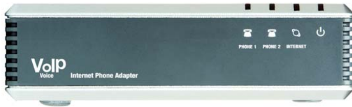
Figure 2-2: Front Panel

The Phone Adapter's LEDs, which inform you about network activities, are located on the front panel.