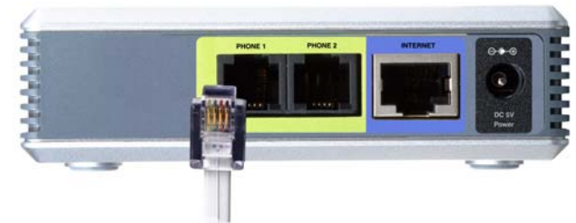
Figure 3-2: Connect the RJ-11 Telephone Cable

IMPORTANT: Do not connect either of the Phone ports to a telephone wall jack. Make sure you only connect a telephone or fax machine to either of the Phone ports. Otherwise, the Phone Adapter or the telephone wiring in your home or office may be damaged.